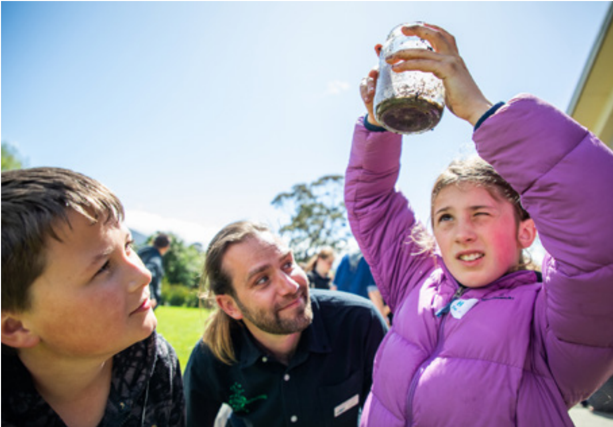
Learning about soil (RZ)

“It’s [Enviroschools] valuable because it involves children learning about how they have the power to make a difference. I have loved the support from Enviroschools hui, cluster meetings and workshops”. (Enviroschools, 2017).