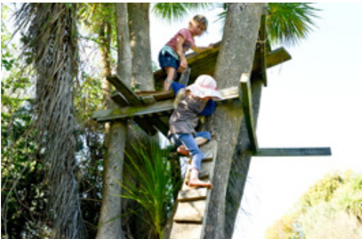
Risky Play (CH)