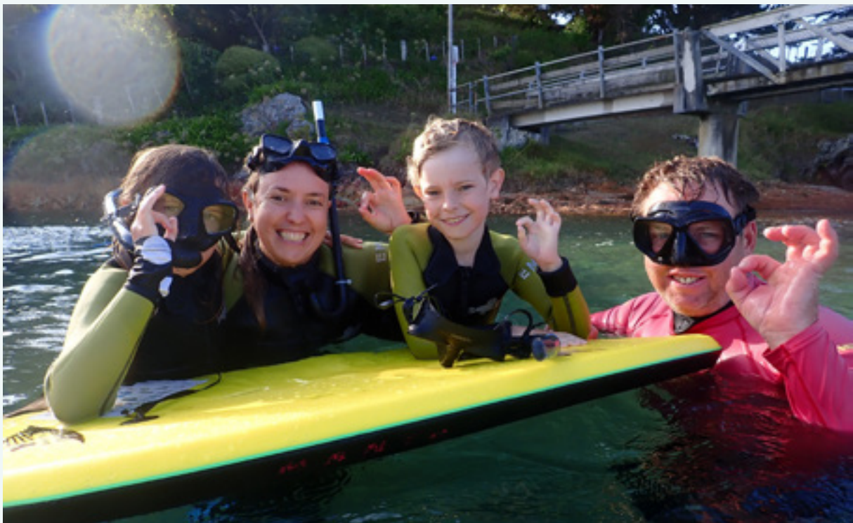
Sea week 2019 Experiencing Marine Reserves