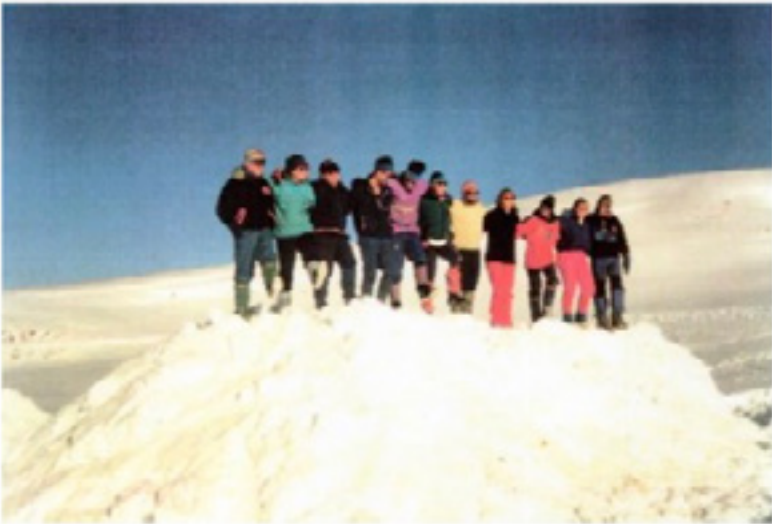
Otago teachers cross country ski course, Cardrona ski field