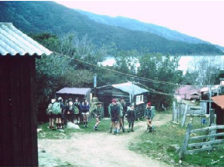
Rangitikei College adventure camp, Resolution Bay

with permanent staff e.g., Port Waikato (1956), Castle Hill (1965), Rotoiti Lodge (1966), Motutapu Island Outdoor Education Centre (1966), Kaitawa (1967), Tautuku Outdoor Education Centre (1969), Borland Lodge (1973), and Boyle River Lodge (1978) (Stothart, 2012). Hundreds of smaller camps owned by regional Education Boards were established by converting small country schools closed through lack of numbers. Mostly, classrooms were customised into bunkrooms, while kitchens and ablutions were expanded. The Boards also established equipment pools and gear trailers, and staffing and funding mechanisms were set up.