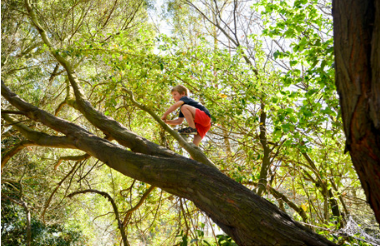
Risky Play (CH)