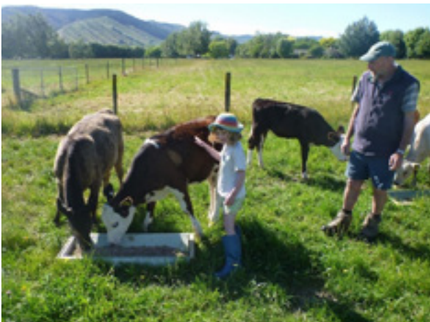
Farm Experience (CN)

As part of this approach, schools in cities and larger towns often had trips to farms and rural areas, as this interview exchange illustrates: