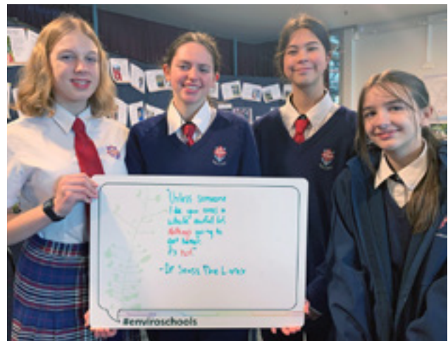
Trinity College Students (RZ)

3. Renwick Kindergarten's community work to create a green space for everyone https://enviroschools.org.nz/creating-change/stories/renwick-kindergarten-enviroschools-journey-with-rousehill-reserve