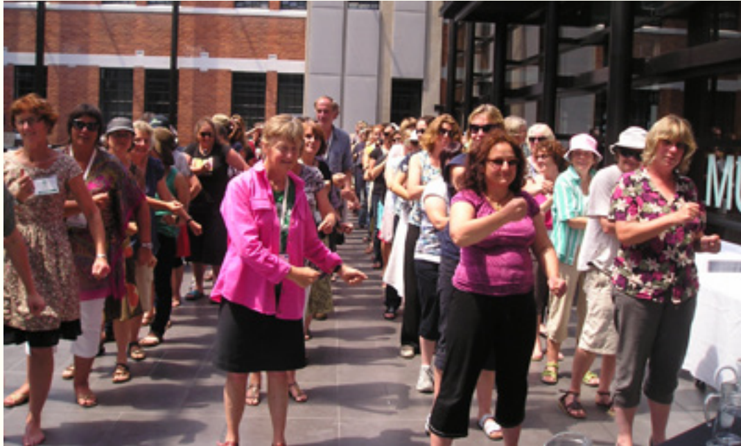
NZAEE, 2012 Wellington Conference

During this period, NZAEE's collaboration with EnviroSchools and the National EfS team was highly significant in promoting education for sustainability at both regional and national levels. This partnership was significant during the 2000s with all three organisations attending meetings together with Government and non-governmental organisations to ensure outcomes for environmental education in the formal sector.