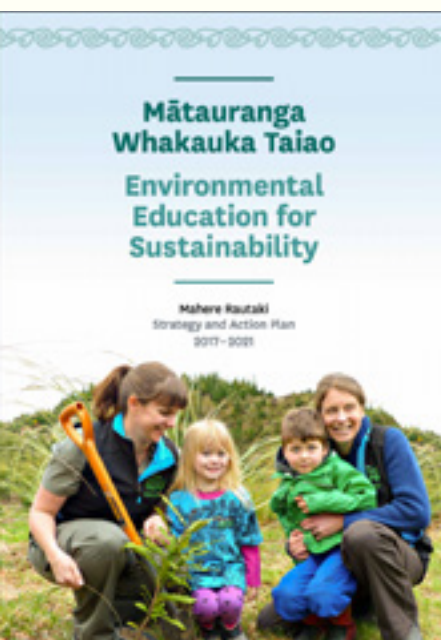
EEfS Strategy Cover

So what is the future of NZAEE? There is little doubt that its work is needed more than ever. Crises in climate and biodiversity are both warnings and symptoms of a human species putting immense pressure on the planet. A different set of knowledge, skills and dispositions to act will be required to overcome these major challenges and it is imperative that all peoples, from their early years through schooling, further study and throughout communities, be given the opportunity to contribute positively to their futures. Through environmental education, NZAEE has a key role to play in creating these opportunities. Whilst funding and traction may be forever uncertain for an organisation like NZAEE, the need for its work is indisputable.