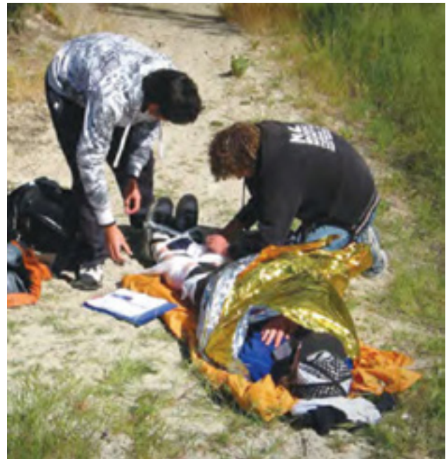
First aid scenario (CN)

Newness here is shown as different from everyday life and also as being very engaging. Now we look at the links between learning and newness.