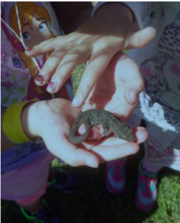
Gecko from EOTC guidelines (CN)

The value of EOTC is not just about newness, but the quality and direction of the learning. While quality learning might use places or activities that are new, we also encourage educators to look for new knowledge or skills in places or activities that are familiar to students. For example, newness can be found in visiting a local place but through a different approach which can show students new ways of looking at their everyday worlds. “This will allow EOTC to benefit student learning by finding newness in the unfamiliar and, just as importantly, finding newness in the familiar” (North et al., 2022, p. 17).