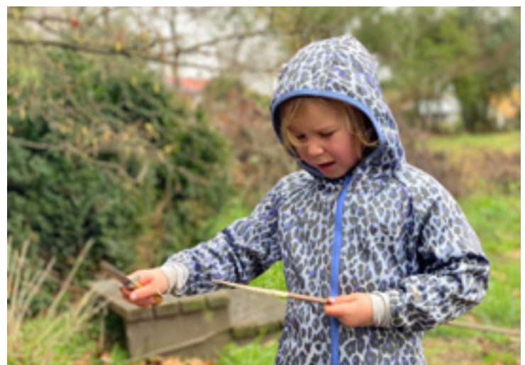
Risky Play (CH)

In the 1960s and 1970s, risky play came under scrutiny, as parents and educators began to advocate for safer playgrounds. As a result, playgrounds were redesigned and the first playground safety standards were introduced in Aotearoa in 1986. The idea of providing a safe and protective environment for children became a top priority and parents started to rely on more sedentary activities like television as a form of entertainment for their children. However, this mindset started to change in the 1990s and early 2000s. Adventure parks and extreme sports began to gain popularity, as the concept of risk broadened from being associated with negative outcomes to becoming more about uncertainties. Research started to back this thinking with studies showing that risky play can help children build self-confidence, develop their decision-making and problem-solving skills, and improve their mental and physical flexibility (Sandseter et al., 2022). Parents started to recognise the benefits of exposing their children to risky play.