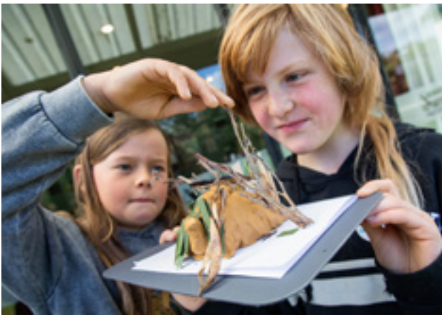
Exploring building with natural materials (RZ)

The facilitated support provided to schools by Enviroschools supports teachers to integrate real-life, place-based learning into their curriculum and actions. One of the themes that emerged from the 2017 Enviroschools census is encapsulated in this comment from a teacher: [Enviroschools] brings a perspective which isn't strongly presented in the NZ curriculum, along with passionate advocates (Enviroschools, 2017).