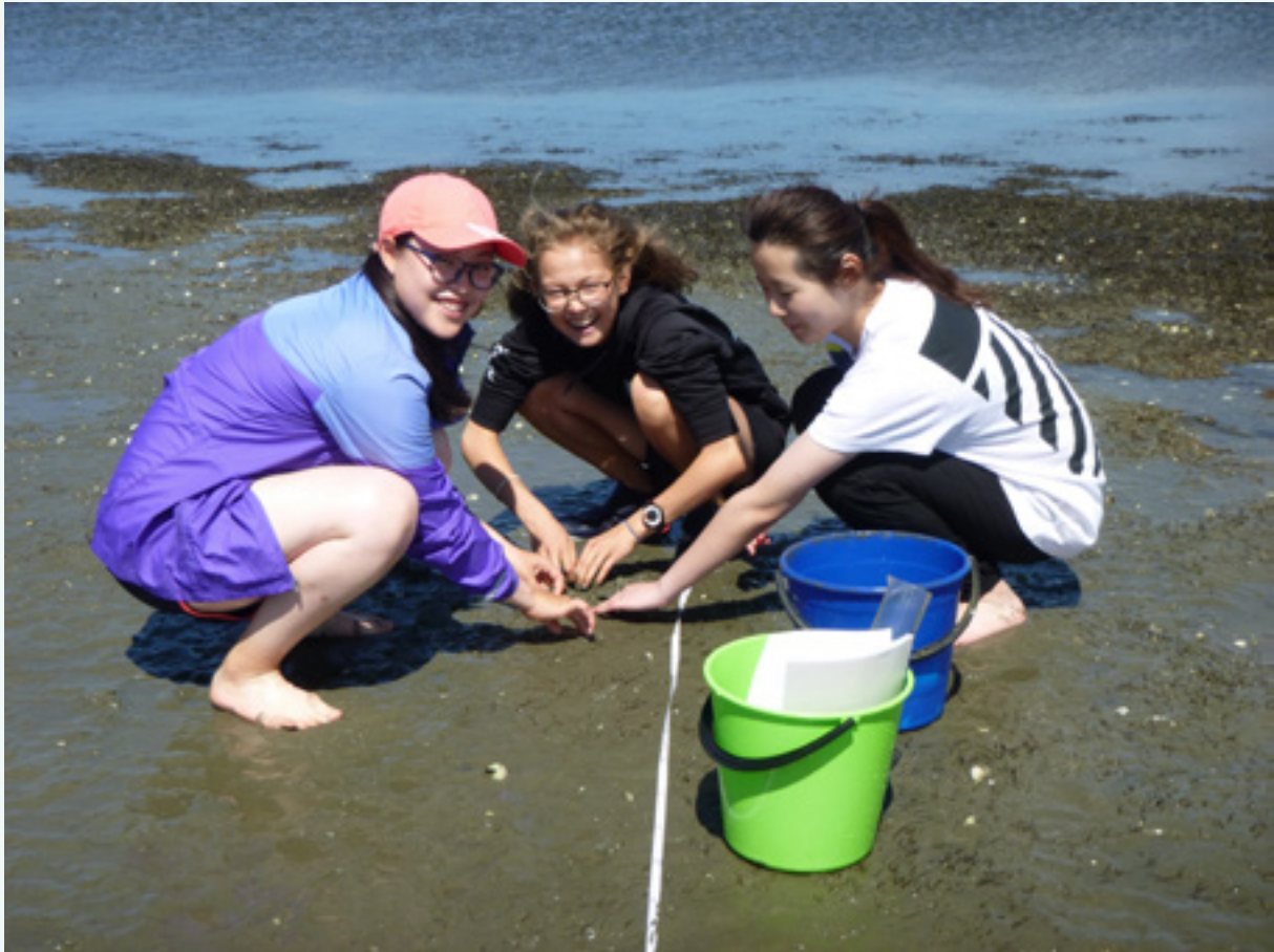
Hauraki Gulf Monitoring Project, Wentworth School, Okoromai Bay, Shakespear Regional Park, 2020.