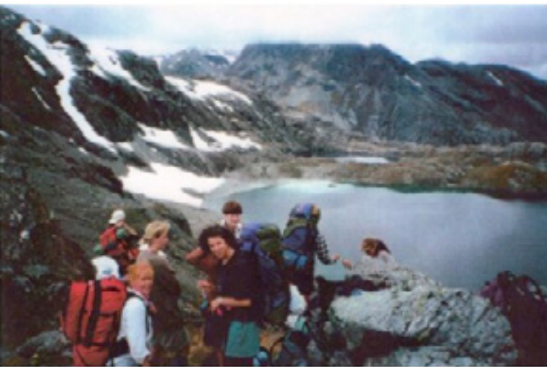
Dunedin College of Education OE group on Temple – Huxley circuit

run residential outdoor pursuits courses for secondary schools. A year later, the Spirit of Adventure Trust was formed by Auckland businessman Lou Fisher to provide large boat sailing programmes for youth. In the educational setting, in 1978 the Tihoi Venture